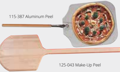
115-387 Aluminum Peel

Aluminum and Wood Peels are great for loading/unloading from oven. Make-Up Peel has an extra large blade, making pizza prep an easy task.