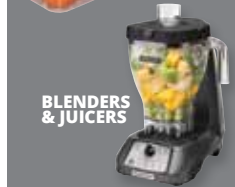
BLENDERS & JUICERS