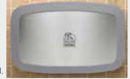
561-013 Gray (Closed)