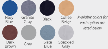
Available colors for each option are listed below