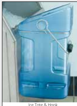
Ice Tote & Hook