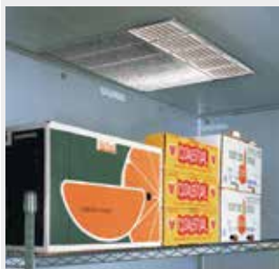
Top Mount Refrigeration System is Flush to Ceiling for 100% Use of Interior Space

Similar footprint to a 3-door reach-in but with 20% to 30% more capacity! Ships in 5 Business Days!