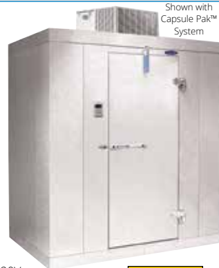
Shown with Capsule Pak™ System