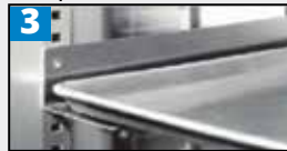
Universal tray slides (six pair). For bottom support of (1) 18"x26" pan, (2) 14"x18" pans or (2) 12"x20" pans per pair of slides.