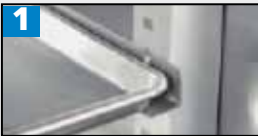
Angle type tray slides (nine pair). For bottom support of (1) 18"x26" pan or (2) 14"x18" pans per pair of slides.