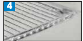
Chrome plated wire shelves (three)