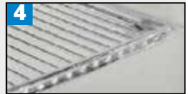
Chrome plated wire shelves (three)