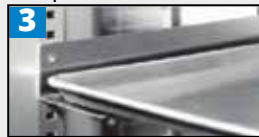
Universal tray slides (six pair). For bottom support of (1) 18"x26" pan, (2) 14"x18" pans or (2) 12"x20" pans per pair of slides.