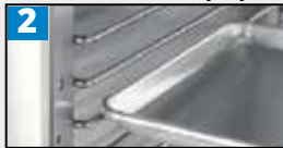
Rod type tray slides (18 rows). For rim support of 18"x26" pans. Accommodates a half-door section only. For light duty applications.