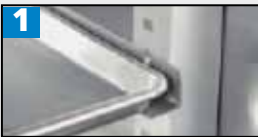
Angle type tray slides (nine pair). For bottom support of (1) 18"x26" pan or (2) 14"x18" pans per pair of slides.