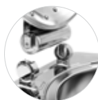
c. Hinge is easier to replace (no tools needed)