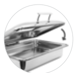
a. Slow closing lid with improved hinge design