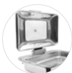
b. Improved hinge design has an integrated stop to keep lid open for serving