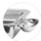
h. Integrated spoon rest for seamless serving, keeping your buffet more sanitary