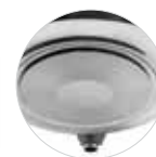
g. Improved induction base integrated into design