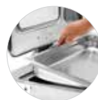
e. Intuitive integrated lip to assist in manually removing steam pans