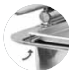
d. New Steam Pan Lifter protects operator from steam burns, making food rotation easier