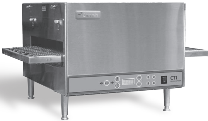
Shown with 31" (787 mm) standard conveyor.