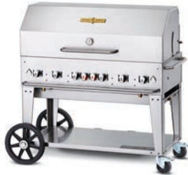
Shown with optional Roll Dome

Our passion at Crown Verity is to bring the precision and performance of commercial kitchens to the outdoor environment. To that end we design and manufacture our grills to be reliable and go beyond traditional industry specifications.