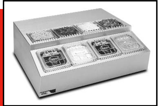
RTR-8 Refrigerated Topping Rail