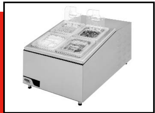
RTR-4 Refrigerated Topping Rail