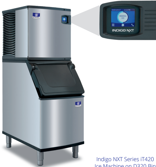
Indigo NXT Series iT420 Ice Machine on D320 Bin

Designed for operators who know that ice is critical to their business, the Indigo NXT Series ice machine's preventative diagnostics continually monitor itself for reliable ice production. Improvements in cleanability and programmability make your ice machine easy to own and less expensive to operate.