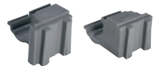
Set of Left and Right Corner Connectors (1 set required per shelf).