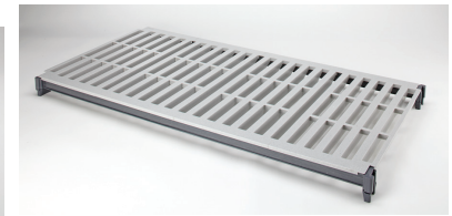
Vented Shelf Kit includes two Traverses and Vented Shelf Set for one shelf.