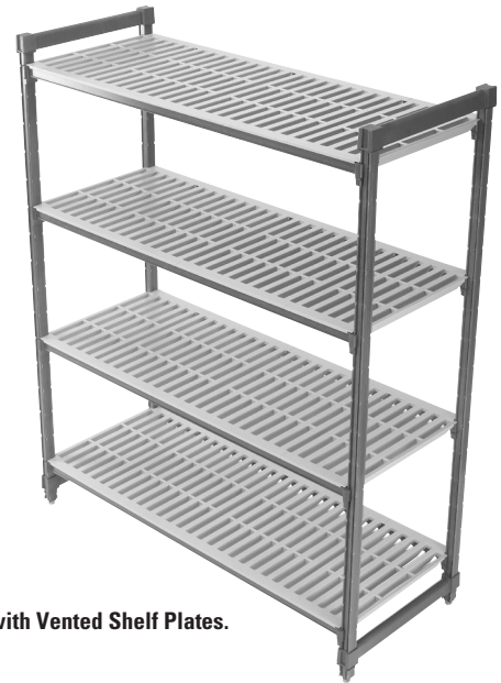
Four Shelf Unit with Vented Shelf Plates.