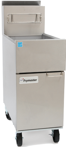
ESG35T Shown with optional casters.