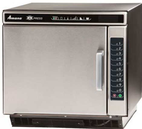
Model ACE19V shown