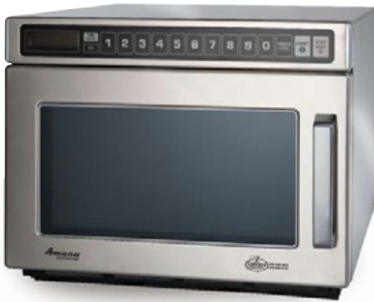
Model HDC212 shown