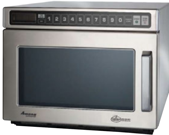
Model HDC182 shown