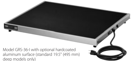
Model GRS-36-I with optional hardcoated aluminum surface (standard 19.5" (495 mm) deep models only)