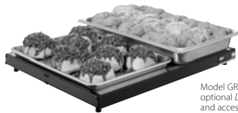
Model GRS-30-I with optional Designer color and accessory food pans

BLANKET ELEMENTS GUARANTEED AGAINST BURNOUT AND BREAKAGE FOR ONE YEAR.