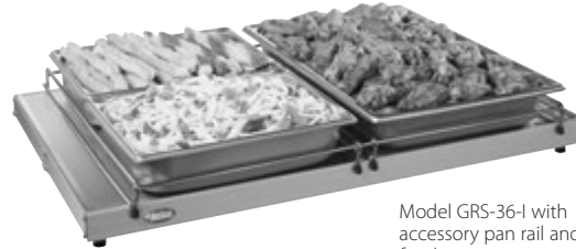
Model GRS-36-I with accessory pan rail and food pans