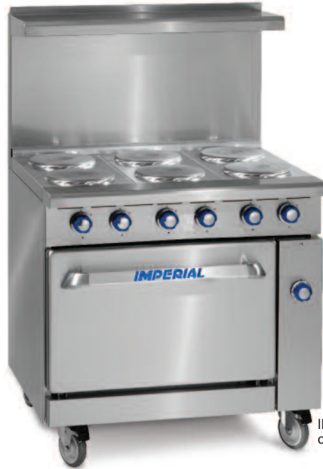
IR-6-E shown with optional casters