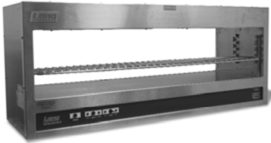
Model 148CMPT shown