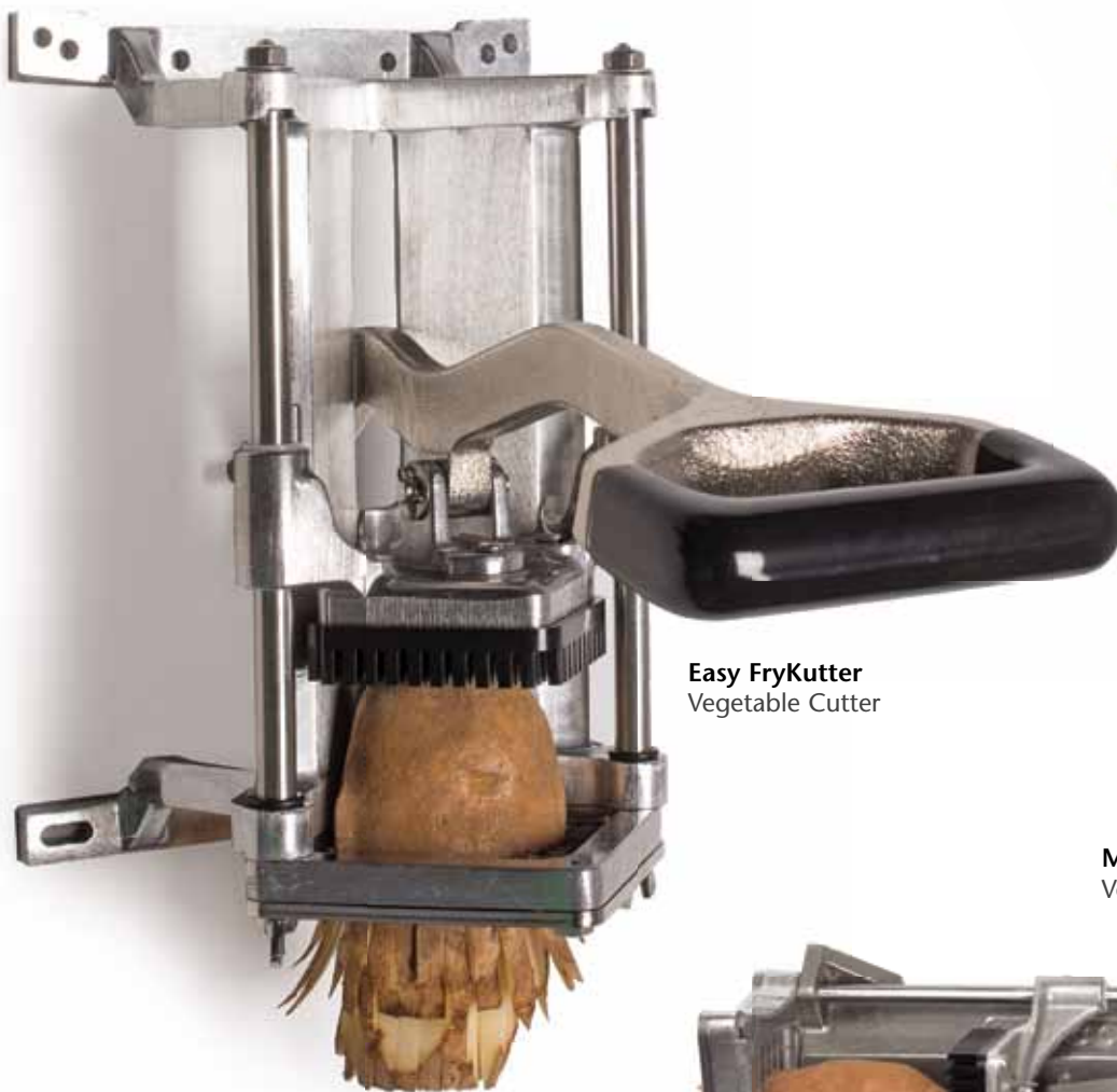
Easy FryKutter Vegetable Cutter

Choose Easy FryKutter for labor savings and improved productivity. Or power through the biggest spuds at lightning speed with the one and only Monster FryKutter.