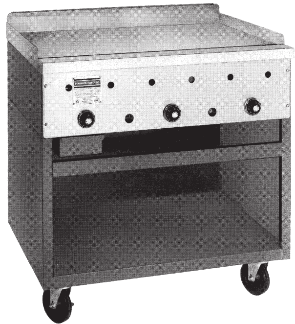
Model GT-36-F-C Pictured With Optional Casters.

The GT Series is a thermostatically controlled griddle that is designed for high performance and maximum capacity, while delivering high gas efficiency. Built for high production and maximum capacity, the griddle plate is 1" thick highly polished steel plate with stainless steel splash guards on three sides. This griddle is not recommended for low temperature cooking. The stainless steel grease trough is attached by a continuous weld to ensure grease proof construction.