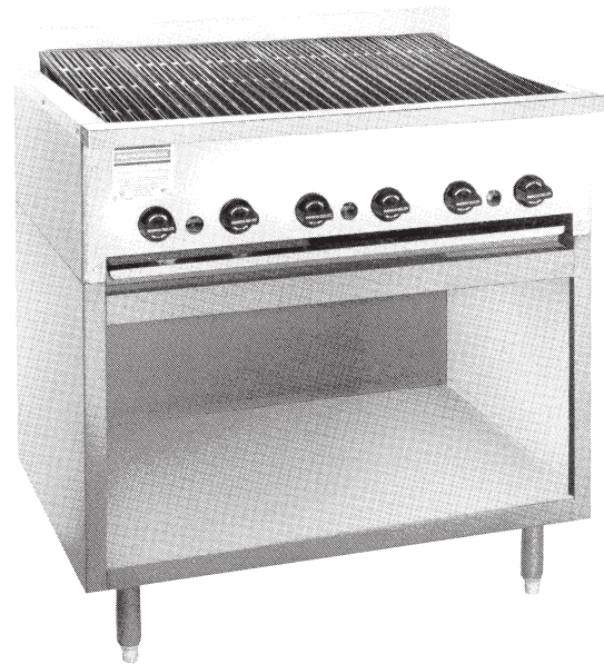
Model RB-836-F-C Pictured With Optional Casters.