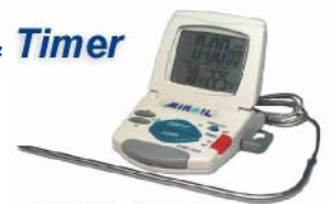
MTT Digital Frying Thermometer & Timer