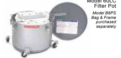
Model 60LC Filter Pot Model B6PS Bag & Frame purchased separately

For filtering and safer handling of hot oil Low profile to fit under drain valves