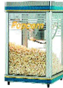
Model G8-Y (8 oz) & G12-Y (12 oz)