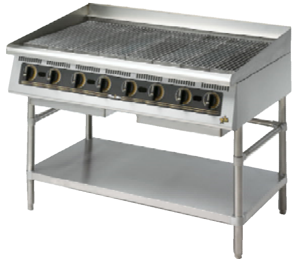
Model 8148RCB Shown with Optional Mobile Equipment Stand