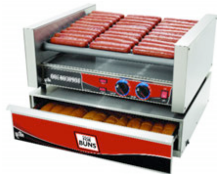
Models X30S Shown with XBW30

Star's Grill-Max ® Express ™ Roller Grills are covered by Star's one-year parts and labor warranty.