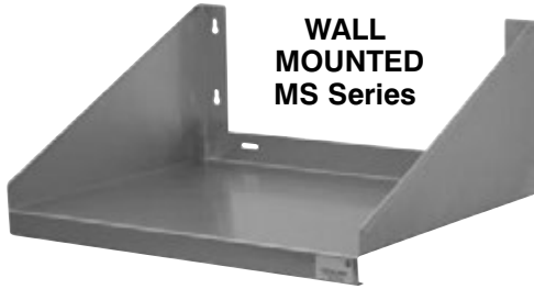
WALL MOUNTED MS Series