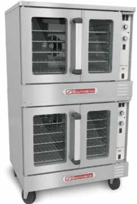
(SLES/20SC shown with optional casters)

SLES/20SC, SLES/20CCH SLEB/20SC, SLEB/20CCH