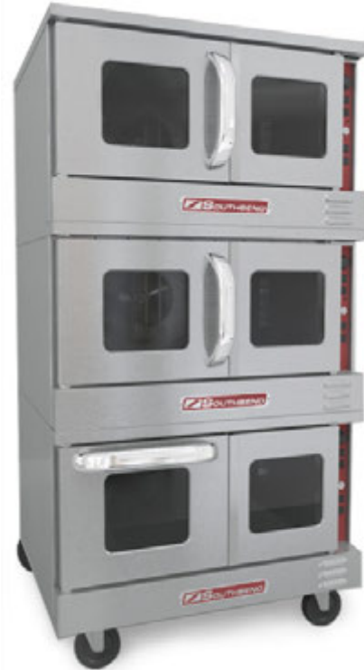
TVGS/32SC shown with optional casters