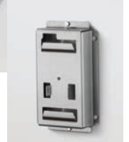
Quick disconnect wall mount bracket