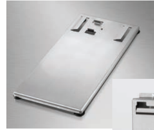
Suction Cup Table Base