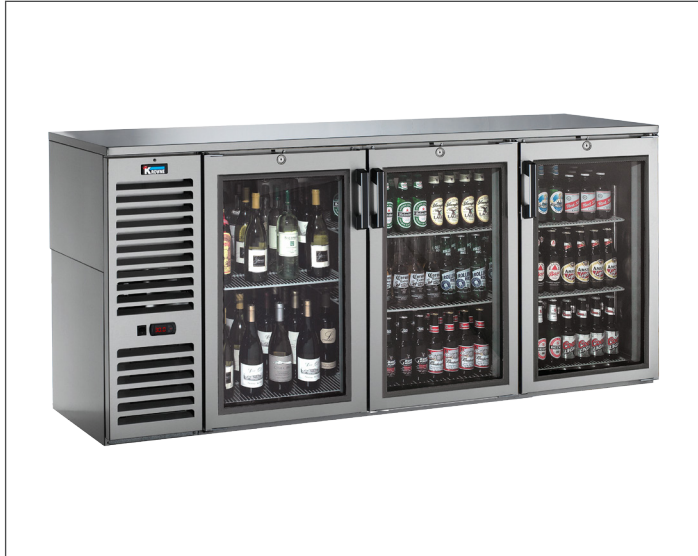
NS72L-KSS-LRR SHOWN with OPTIONAL 1" TOP and KICK PLATES