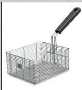
Optional 3 lb. Single Basket Available #LFB75