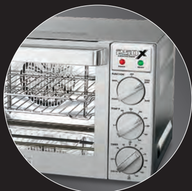
WCO250X: 2 baking racks and 1 quarter-size sheet pan included