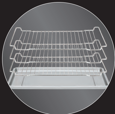
WCO500X: 3 baking racks and 1 half-size sheet pan included