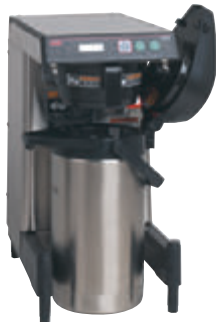
Model WAVE-APS with 2.5L lever-action Airpot (airpot sold separately)

Dimensions: 16.94-18.69" H x 9.71 W x 17.24"D (43cm H x 22.2cm W x 43.8cm D)