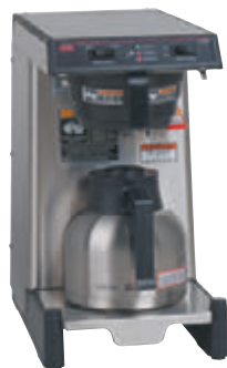
Model WAVE-S-APS with Deluxe 1.9L Thermal Carafe (thermal carafe sold separately)

Dimensions: 16.94-18.69" H x 9.71 W x 17.24"D (43cm H x 22.2cm W x 43.8cm D)