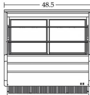
TCGB-48-2/DR FRONT VIEW