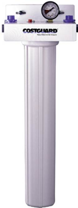
CGS-20 20" Single Housing: DEV9100-20