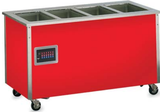
Signature Server® with Stainless Steel Counter 4 Well Hot Food Base